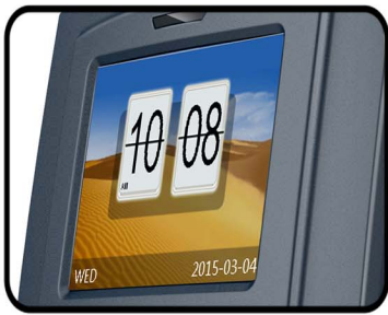
2.4 TFT color screen