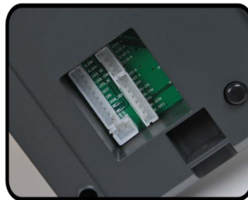
2 × Relay, wiegand in & out