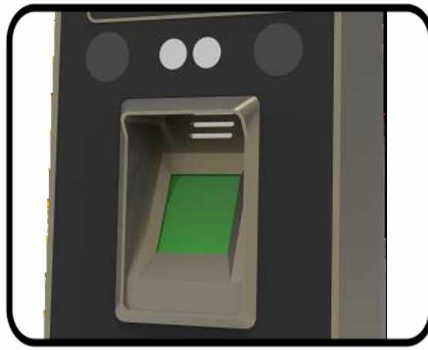
Face & Fingerprint Sensor