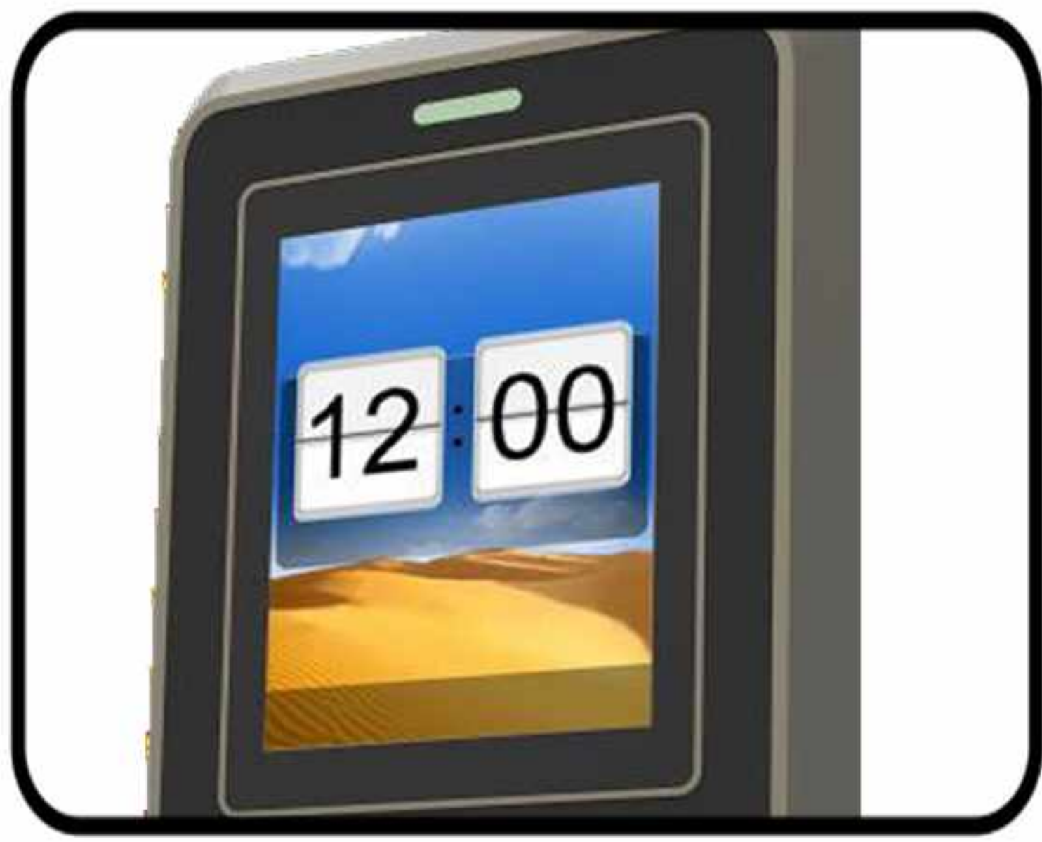
2.8 Inches Touch Screen